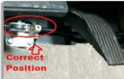
Correct Driver's Side Position